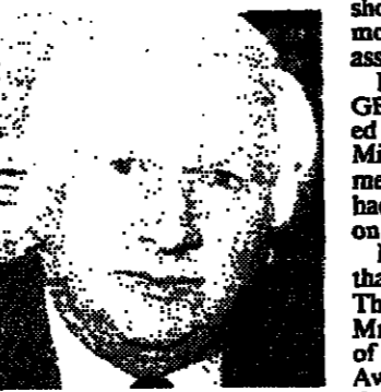
James Prior: claims contest was rigged

Mr James Prior, a former Cabinet Minister who is chairman of GEC, is claiming that the competition has been rigged against the British option, while the RAF is hitting back furiously, saying that he is impugning its honour.